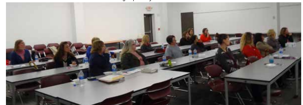
A nice group of very interested attendees