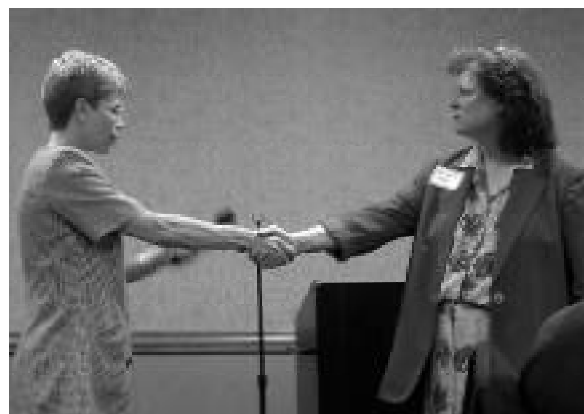
November workshop leaders demonstrating a point.