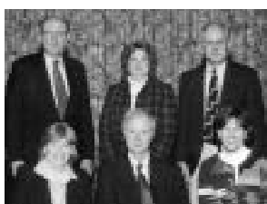
Boss of the Year nominees