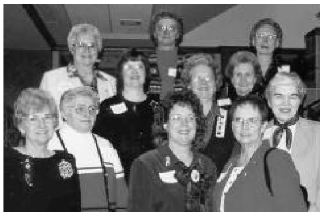
Some of the past-presidents attending the Annual Past-president and Retiree Recognition and Awards Luncheon in April.

I also sent notices or press releases to the Scarlet and E-news about our regular meetings and special events like our 40 th Anniversary Celebration, Bosses Luncheon and Awards Luncheon.