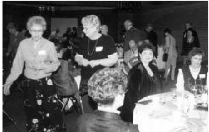
The 40th Anniversary Celebration attracted over 90 current and former members and their guests in February at the East Union.