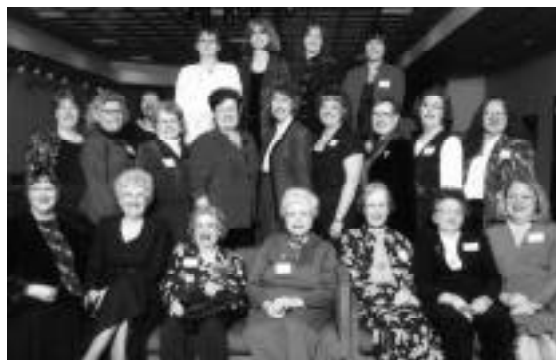
Past Presidents attending the 40th Anniversary Celebration.