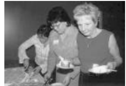
Members of the anniversary committee cut and served cake during the celebration.